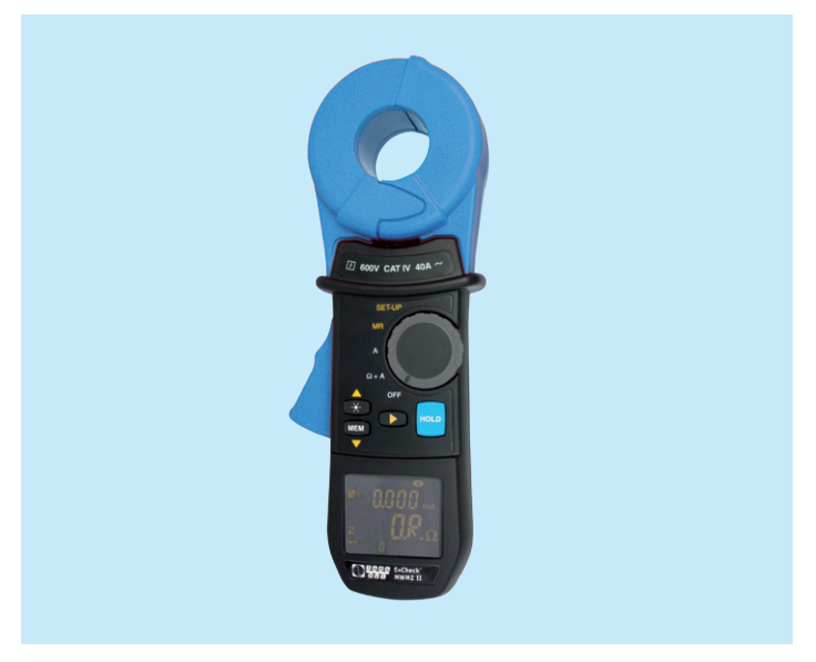
EmCheck® MWMZ II