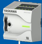
MICRO PROFINET I-Device